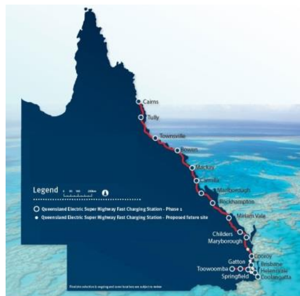
Map of the Queensland Electric Vehicle Super Highway