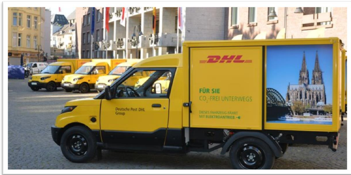
DHL StreetScooter manufactured in Germany

DHL is also now planning to investigate the manufacture of electric vehicles in Australia. These electric vehicles could be similar to the StreetScooter currently manufactured by DHL in Germany.